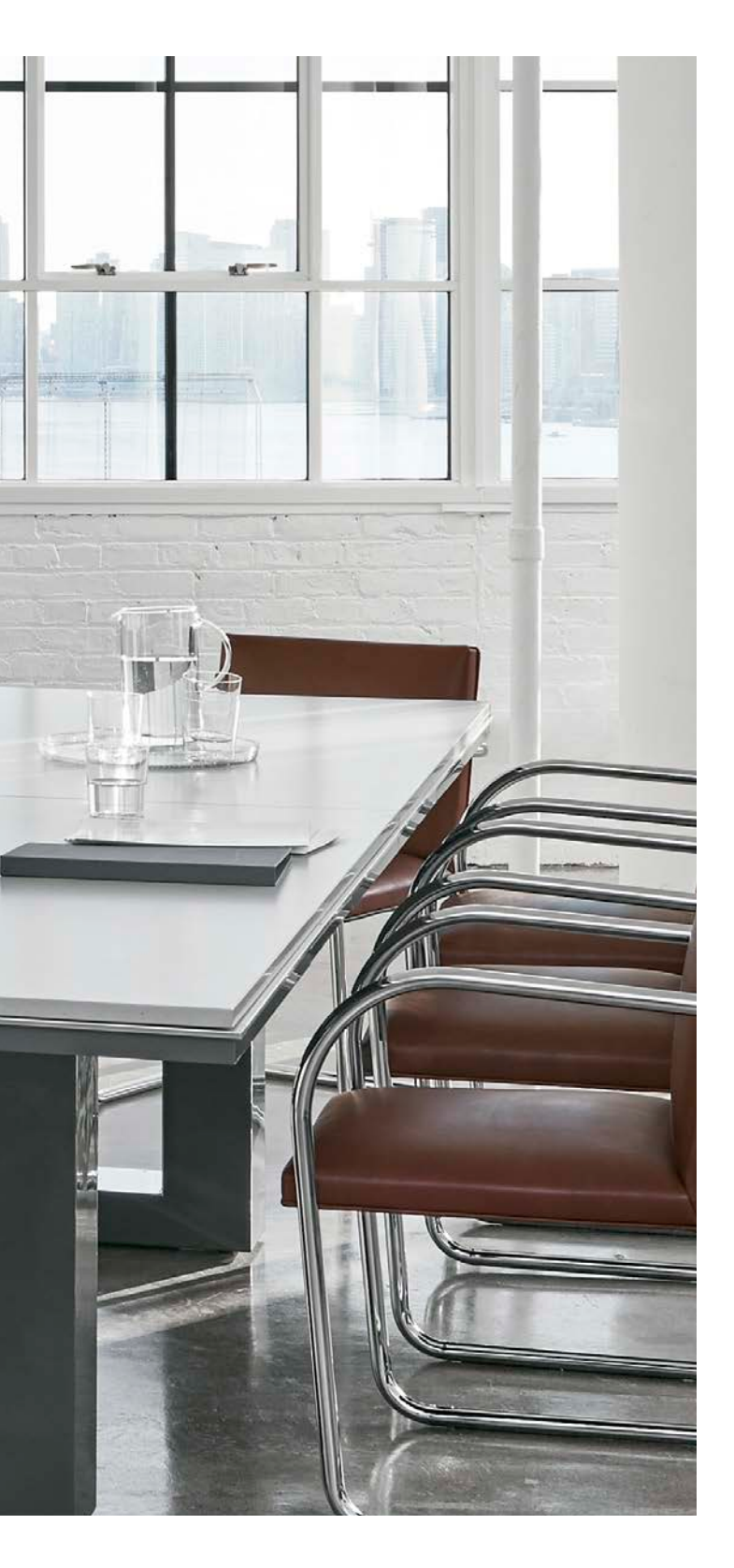
Page 1: Highline Twenty-Five Credenza, Coco case, Plain-sliced White Oak doors & drawers, Oil Rubbed Bronze base & pulls.

Page 3-4: Highline Fifty Conference Table, Caesarstone, Raw Concrete top, Polished Chrome trim, Umbra Grey Iower layer & base.