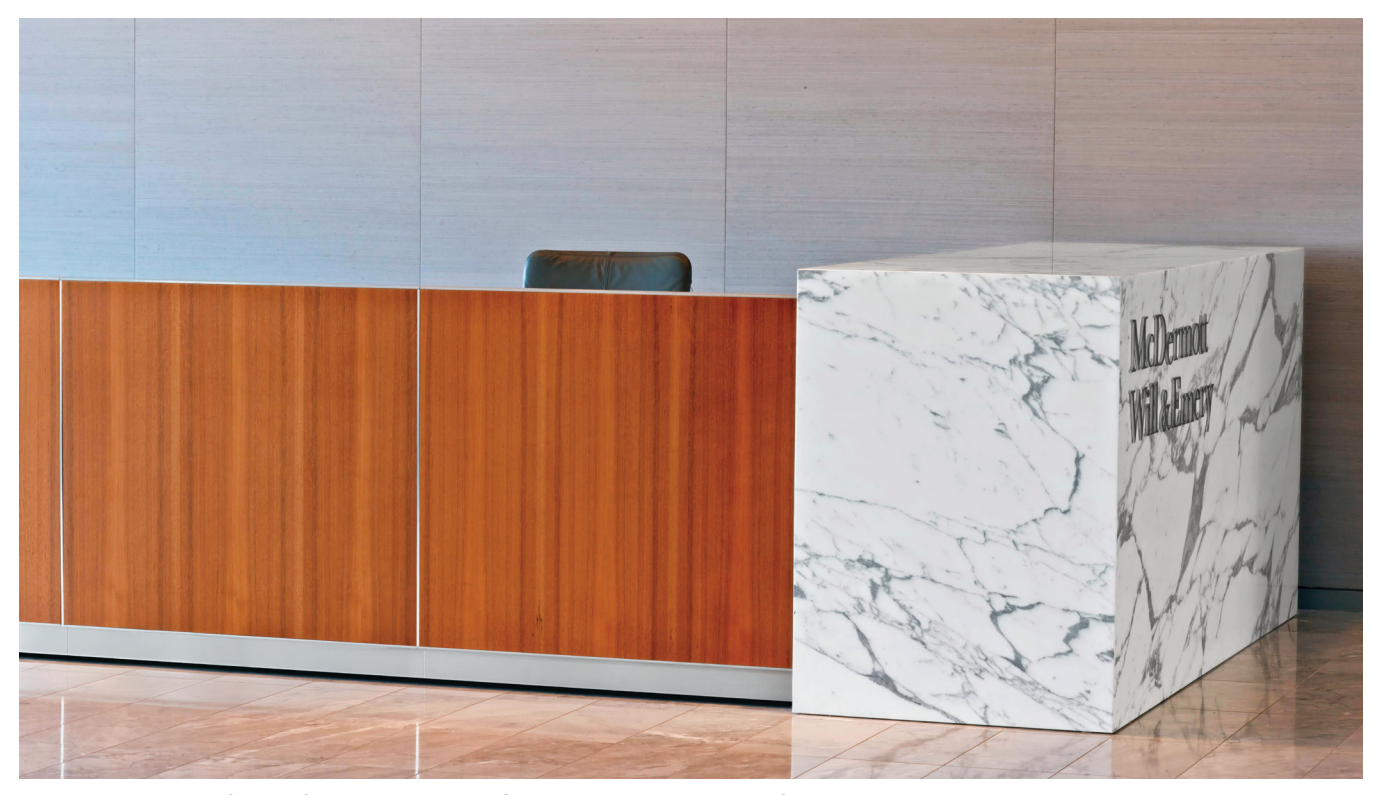
A Washington, D.C. law firm anticipating future growth sought a flexible environment with a modern, understated look and state-of-the-art A/V systems in its conference rooms. The design vocabulary features rich, tactile materials that extend from the reception area into hallways, offices, and collaborative spaces.