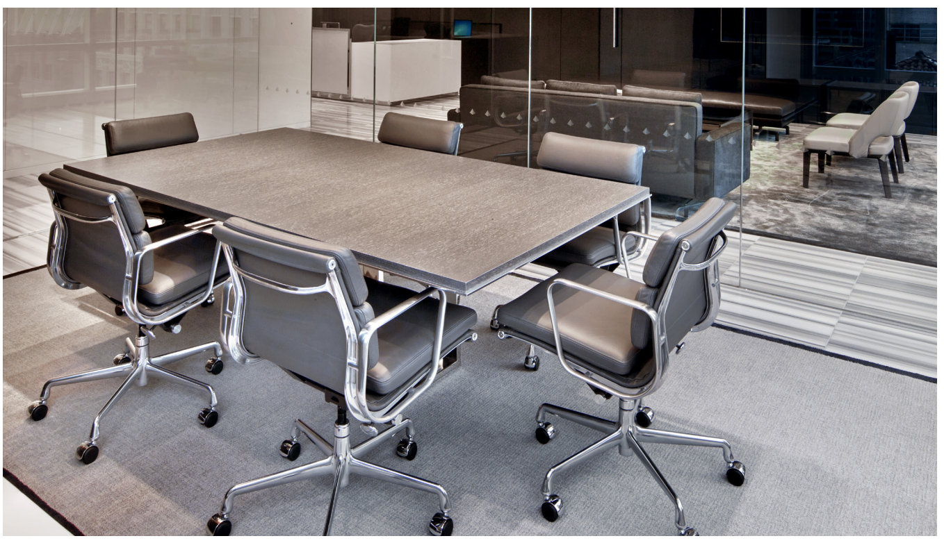
A boutique financial firm conveys a high-end, luxury look with rich woods combined with polished chrome details. The warm neutral tones engage employees and guests.